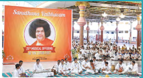
A musical concert by Sanathana Vaibhavam group.

On 3rd November 2018, Sanathana Vaibhavam, a group of alumni of Sathya Sai Mirpuri College of Music, presented a sterling music concert which was their 25th musical offering to Bhagavan as part of 95 concerts to be offered by them in preparation of Bhagavan's 95th Birthday celebrations. Beginning their concert with a prayer song to Lord Ganesh, the singers and musicians presented instrumental