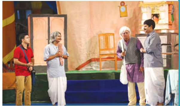
A scene from the drama "Watch your WATCH".

thematic drama "Watch your Watch" based on Bhagavan's teachings: watch your words, watch your actions, watch your thoughts, watch your character and watch your heart. The story of the drama depicted how a watch maker from Kolkata regretted when his watch materialised by Bhagavan for him stopped as there was exchange of harsh words between him and his son who left home in a huff. However, it started working again when there was happy reunion of the family in the end after 40 long years of their separation. Through this simple story, the drama taught that there were happy and difficult times in man's life but man should