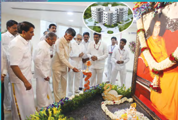
The Chief Minister lighting the lamp to inaugurate "Central Research Instruments Facility" (Inset: a view of the building).

students assuring them of high quality training. The Chief Minister had a detailed