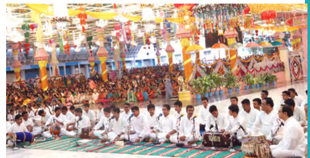
Sneh Dhara Barsao Sai: A devotional music presentation.

of Bhagavan's 93rd Birthday celebrations on 24th November 2018. Beginning their programme with the Bhajan "Koti Pranam Shata Koti Pranam" (crores and crores