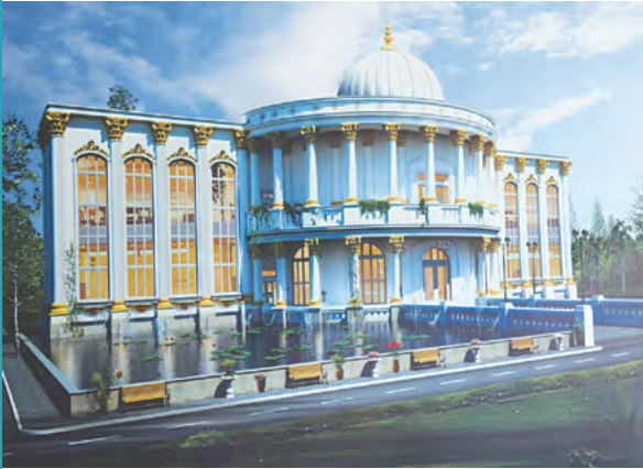
A model of Sri Sathya Sai International Convention Centre.

Bhumi Puja (ground breaking ceremony) of the forthcoming Sri Sathya Sai International Convention Centre at Prasanthi Nilayam was performed amidst