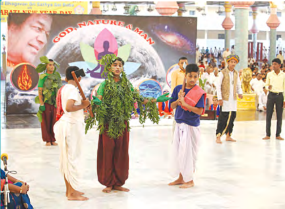
The drama “God Nature and Man” showcased the necessity of preservation of Nature.

Man”, which was enacted by the boys students of Sri Sathya Sai Vidyaniketan, Navsari, giving the powerful message of preservation of Nature and cautioning man not to pollute the environment and the five elements. A beautiful Qawali as part of the drama made the presentation all the more enriching. After Bhajans and Arati, the programme concluded in Sai Kulwant Hall. Thereafter, devotees enjoyed the display of fireworks in Yajur Mandir in celebration of Deepavali, the festival of lights.