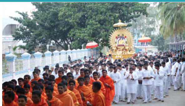
A grand procession of the golden chariot going round the Yajur Mandir.

After the glorious morning celebrations, the evening programme commenced at 5.00 p.m. with golden chariot procession, which started from the Ganesh Mandir, went round the Yajur Mandir and came back to Sai Kulwant Hall through Gopuram Gate where Arati was offered to it. Participated by