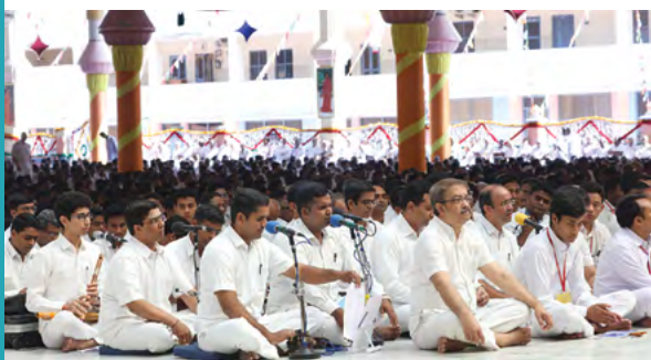
A devotional music offering by Prasanthi Bhajan Group.

The last item of the morning programme was a soul-stirring musical offering by Prasanthi Bhajan Group which gave the powerful message of inherent divinity of man in the devotional composition of Sant Kabir “Moko Kahan Dhoonde Bande Mein To Tere Paas Mein” (oh man, where do you search for Me when I am within you). Blending the teachings of all faiths in a unified musical composition, the singers transported the entire congregation to a higher plane by