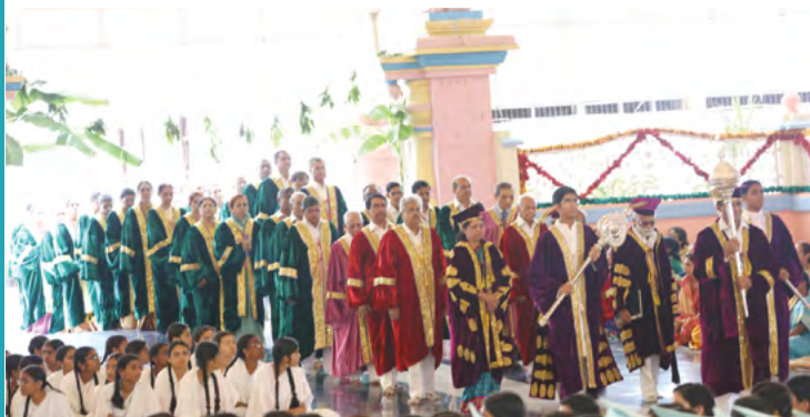
Academic Procession in Sai Kulwant Hall.