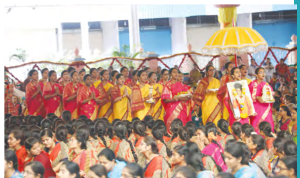
The procession of ladies entering Sai Kulwant Hall.

the sonorous strains of Rudram chanting filled the air, a grand procession of ladies entered Sai Kulwant Hall led by Nadaswaram and brass bands of Anantapur Campus and bagpipers band of Sri Sathya Sai Higher Secondary School. Senior ladies carrying Poornakumbham then offered obeisance