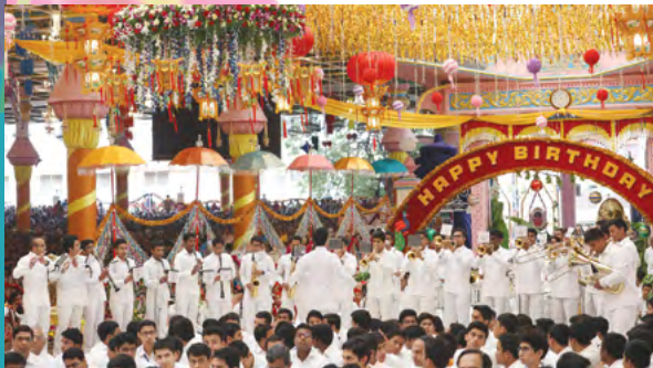
Display of band music by Institute students.

display of band music by Panchavadyam, Nadaswaram groups of Institute students as also the band music of the Primary School students. They all took turns to offer their