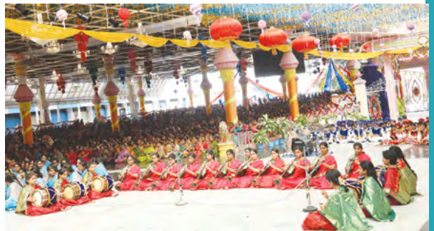
Nadaswaram group of students offering musical tributes to Bhagavan.

Ladies Day was celebrated at Prasanthi Nilayam on 19th November 2018 as part of Bhagavan's 93rd Birthday celebrations. The morning proceedings commenced at 8.00 a.m. with Veda chanting by the students of Anantapur Campus of the Institute. Even as