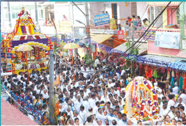
Rathotsavam procession in Puttaparthi.

and Veda chanting and Bhajan singing groups of students. After due ceremony, the idol of Venugopal Swami was mounted on a decorated chariot. The procession then moved towards Patha Mandir witnessed by residents of Puttaparthi who occupied every available space on the road and balconies of their houses to see this grand spectacle of Rathotsavam. All through the route, people offered Arati and broke coconuts with great reverence before the idols. After the arrival of the procession at the Old Mandir, the procession started its return journey with idols of Sita, Rama, Lakshmana and Hanuman. The sacred festival of Rathotsavam concluded with the conclusion of Bhajans in Sai Kulwant Hall.