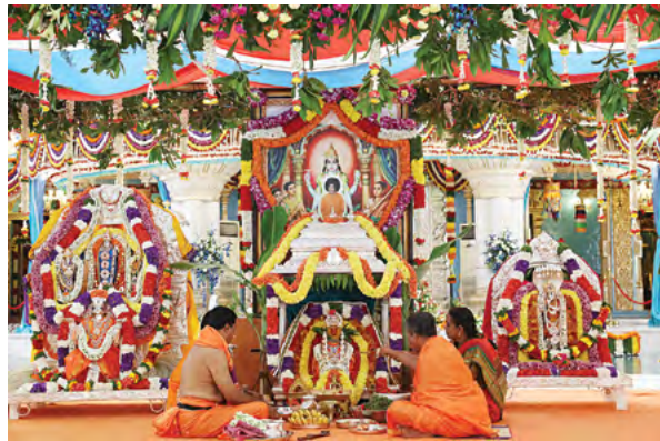
Sri Sai Sathyanarayana Puja.

The entire Prasanthi Nilayam township bore a festive look with beautiful decorations. Sai Kulwant Hall, the venue