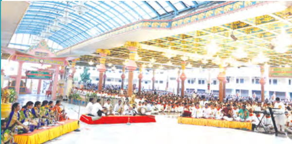
Naada Vadya Goshti presentation by the devotees of Nellore district of Andhra Pradesh.

A LARGE CONTINGENT OF devotees came from Nellore district of Andhra Pradesh on their two-day Parthi Yatra (pilgrimage to Puttaparthi) on 27th and 28th October 2018 and offered beautiful music and cultural programmes on both the days. The first programme presented by them on 27th October 2018 was "Naad