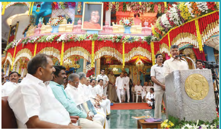
The Chief Minister of Andhra Pradesh Sri N. Chandrababu Naidu addressing the devotees.

After this, the Chief Guest of the celebrations, Sri N. Chandrababu Naidu, the Chief Minister of Andhra Pradesh, offered reverential tributes to Bhagavan. Reminiscing his old association with Bhagavan and Prasanthi Nilayam, the Chief Minister expressed satisfaction at the same level of dedication, enthusiasm and energy which he witnessed at Prasanthi Nilayam earlier when Bhagavan was physically present. Referring to his visit this time, he said, "This is Baba's call to do better service, and to work with all of you". Profession would give professional satisfaction, business would give monetary satisfaction, but the real satisfaction was given only by Baba, asserted the Chief Minister. Speaking on the aim of human life, he stressed the importance of service. He said, our service in this lifetime alone would be remembered. Hailing Sri Sathya Sai Seva Organisation for its yeomen service