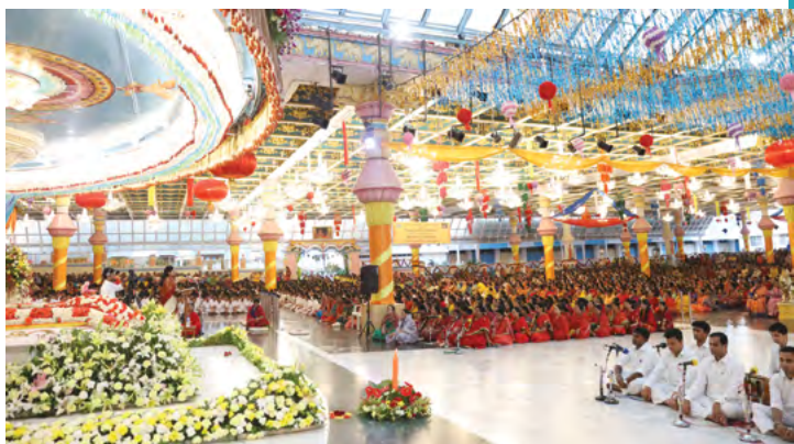
Jyoti Meditation session in Sai Kulwant Hall.

An elevating session on Jyoti Meditation followed this. An audio clip was first played, in which Bhagavan explained the significance of Jyoti Meditation and recounted its performance step by step. How the flame should be lit inside which should spread its light and illumine the inner being and thereafter engulf the entire universe, was