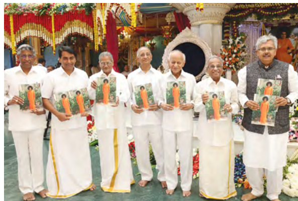
Annual Report (2017-18) of Sri Sathya Sai Central Trust released by the Trustees.

After this elevating musical offering of the students, the Annual Report of Sri Sathya