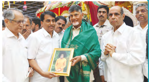
Felicitating the Chief Minister Sri N. Chandrababu Naidu.

worldwide, the Chief Minister reminded the devotees of their collective responsibility to carry Bhagavan's legacy across the borders, on to globally expansive vistas. The Chief Minister concluded by expressing hope to visit Prasanthi Nilayam often to get himself