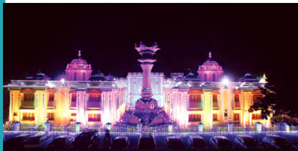
Illuminations at the Yajur Mandir.

The proceedings of Rathotsavam began after the conclusion of this Puja. While Bhajans started in Sai Kulwant Hall, the idols of Venugopal Swami as well as Rama, Lakshmana, Sita and Hanuman were carried to Gopuram gate in a grand procession led by Nadaswaram musicians