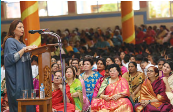
The Chief Guest Ms. Wided Bouchamaoui delivering her Ladies Day address.

The Chief Guest of the celebrations was Ms. Wided Bouchamaoui, Nobel Peace Prize Winner 2015 from Tunisia.