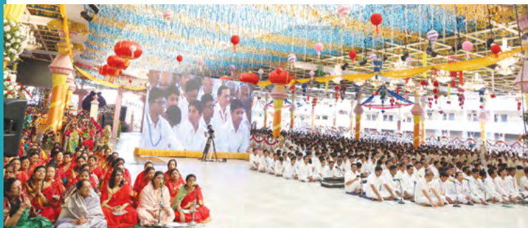
A group of singers rendering the theme song of the conference.