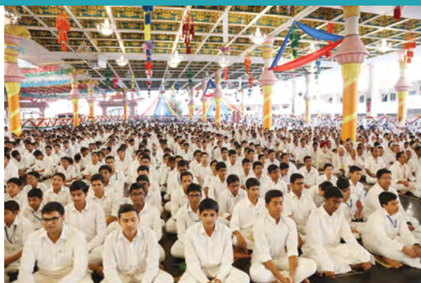
Mass recitation of the Mantra “Om Sri Sai Ram”.