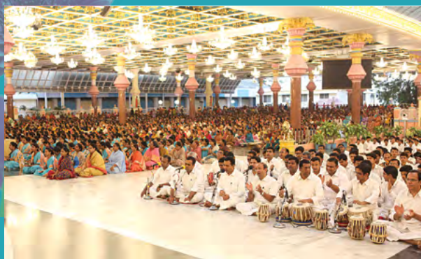
Akhanda Bhajan at Prasanthi Nilayam.

6.00 p.m. sharp, the Akhanda Bhajan led by the students of Sri Sathya Sai Institute of Higher Learning started in Sai Kulwant Hall, wherein a large concourse of devotees and students participated. Besides the students, groups of Ashram and hospital staff and devotees from India and overseas countries took turns to lead Bhajans. It continued throughout the night of 10th November and concluded at 6.00 p.m. on 11th November 2018 with the beautiful Bhajan “Narayana Bhaja Narayan” in the golden voice of Bhagavan. After Arati, Prasadam of sweet rice and tamarind rice was distributed to the entire congregation.