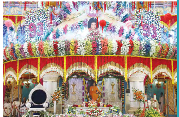
The Samadhi of Bhagavan beautifully decorated on Bhagavan's Birthday.

The Birthday function of Bhagavan Sri Sathya Sai Baba was held in magnificently decorated and brilliantly lit Sai Kulwant Hall on 23rd November 2018, which was joyously witnessed by a mammoth gathering