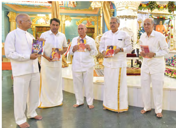
Special issue of Sanathana Sarathi released in Sai Kulwant Hall.