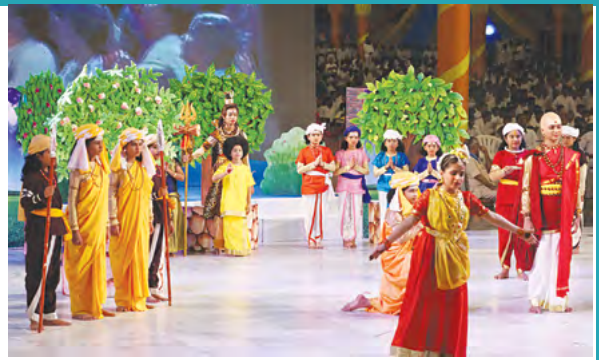
Sai Katha, a drama by Primary School students.

The grand finale for the evening was a musical dance drama by the students of Sri Sathya Sai Primary School, Prasanthi Nilayam. The presentation titled "Sai Katha" was the story of Swami's unmatched glory, lucidly illustrating some of the most beautiful episodes from the life of Bhagavan. The presentation interspersed with beautiful commentary, songs and dances turned out