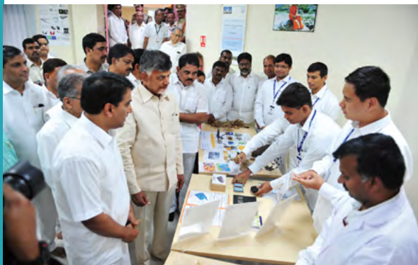
Research scholars explaining their field of research to the Chief Minister.

students assuring them of high quality training. The Chief Minister had a detailed