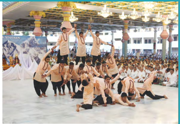
A beautiful dance presentation by the students of Sri Sathya Sai School, Surat.

melodious song seeking the lights of the lamp of illumination within was followed by a dance presentation by the girls students of Sri Sathya Sai School Surat, to the tune of the song “Maa Saraswati Varade” (grant the boon, oh Mother Saraswati) invoking the grace of the goodness of knowledge. The last presentation of the evening was a thematic drama “God, Nature and