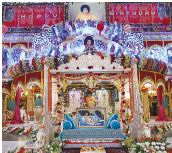
Jhoola Mahotsava in Sai Kulwant Hall.

Jhoola Mahotsava, which followed this chariot procession, marked the grand finale of Bhagavan's 93rd Birthday celebrations.