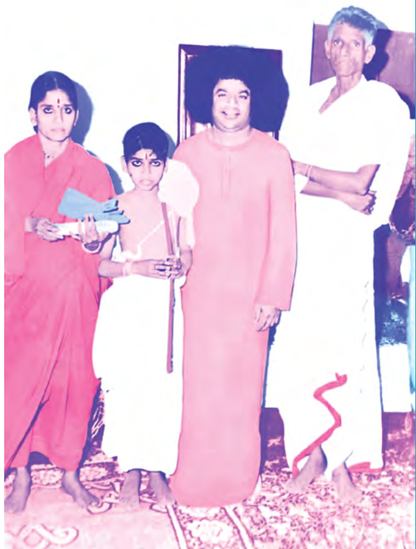
The author with Bhagavan after his Upanayanam.

By then, my elder brother had studied 84 verses of Krishna Yajur Veda in the Veda Pathashala (Vedic school) of