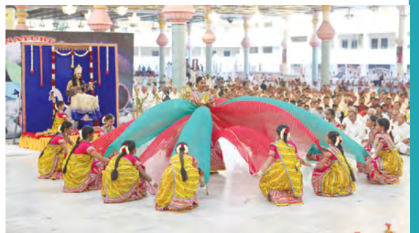
A dance presentation by the students of Sri Sathya Sai School, Surat.

A large contingent of devotees came to Prasanthi Nilayam from the State of Gujarat to celebrate Deepavali and Gujarati New Year as part of their two-day Parthi Yatra (pilgrimage to Puttaparthi) on 7th and 8th November 2018. The programme on 7th November 2018 began with a devotional song titled "Mangal Deep" (auspicious lamp) sung by the Mahilas (ladies) of Navsari district. This