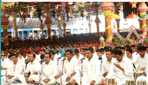
Musical offering "Guru Vandana" by students of Bhagavan's educational institutions.

The students of Bhagavan's educational institutions thereafter made a reverential musical offering "Guru Vandana" (salutations to the Guru) comprising Stotras and devotional songs. Beginning their offering with recitation of Sai Gayatri, the students poured out their hearts to sing the glories of their Divine Mother with deep love and devotion. The compositions rendered by them included "Dil Chahta Hai Ye Din Baar Baar Aaye" (we wish that this day