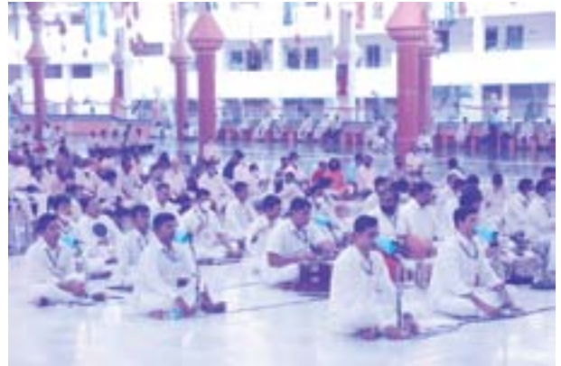
Andhra Pradesh devotees leading Bhajans.

The programme in the evening started with regular Veda chanting by the Prasanthi Mandir Veda Group at 5.00 p.m. What followed next was an illuminating Discourse of Bhagavan which was played on the LED screen. In His Discourse, Bhagavan emphasised that of all