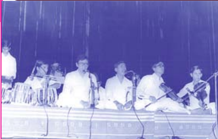
The author singing in a music programme.