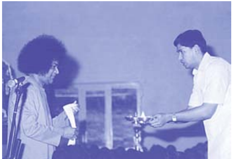
The author offering Arati to Swami.

After that lean period, Swami took me to Kodaikanal for a month. It was again a joyous period. He made me offer Arati to Him after the