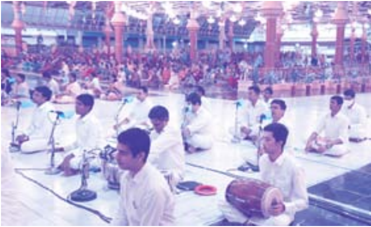
Bhajans led by Tamil Nadu State Bhajan Group.

Prasanthi Mandir Veda Group. At 5.30 p.m., the devotees were blessed with a Divine Discourse of Bhagavan, in which Bhagavan stated that happiness and sorrow in the life