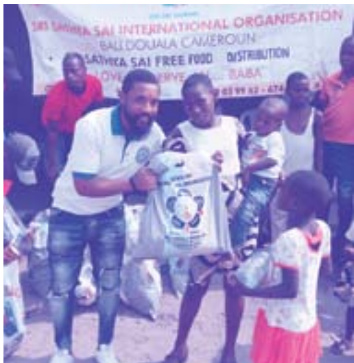
Distributing food to the needy in Cameroon.

blind and physically challenged children, and people living in slums as well as needy people, around the country.