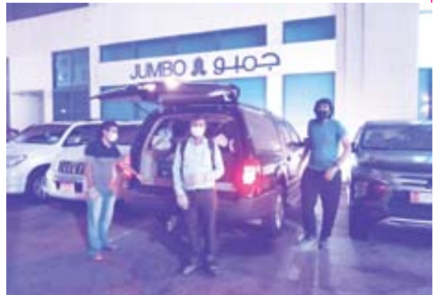
Serving the needy in Abu Dhabi.

On 5th and 6th December 2020, SSSIO volunteers distributed 126 hampers at Camel Camp, located in a remote desert near Abu Dhabi. These hampers contained