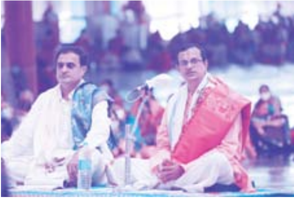
Panchanga Sravanam in Sai Kulwant Hall.

types of knowledge, spiritual knowledge was most important for man's life. Man, Bhagavan added, should acquire this knowledge and spread it. He should perform his duty with his best abilities and strength while focusing his mind on God, Bhagavan said. He cautioned one and all not to waste their time in idle