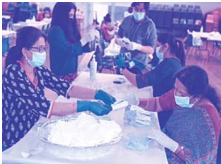
Birthing kits for children to prevent fatalities at childbirth.

SSSIO volunteers from the New South Wales (NSW) Region commemorated the 95th year of the Advent of Bhagavan Sri Sathya Sai Baba with many events. The celebration started with SSSIO volunteers from NSW Region West practising Ceiling on Desires for 95 days and utilising the savings to purchase 2,800 birthing kits which help to prevent fatalities and infections during childbirth. On 5th December, 90 volunteers assembled the