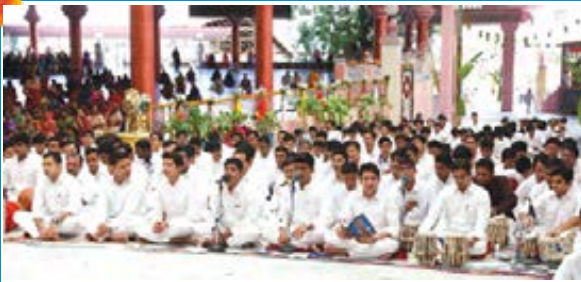
Students of Bhagavan's educational institutions singing the glory of Lord Ganesh.

programme with the recitation of the Stotras Ganashtakam and Ganesh Pancharatram, they followed it with soulful devotional songs which included "Morya Morya", "Om Gam Ganapataye Namah", "Sri Ganesha Sivuni Kumara" (Sri Ganesh, the son of Lord Siva). The morning programme concluded with Arati after a brief session of Bhajans dedicated to Lord Ganesh.