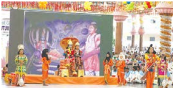
A scene from the drama by Bal Vikas students and Sai Youth of East Godavari district.

In the evening, Bal Vikas children and Sai Youth of this district presented a dance drama which beautifully depicted