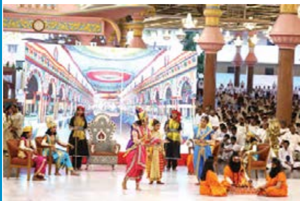
The drama "The Death of Arrogance" brought alive the mythological story of subjugation of the ego of Daksha Prajapati.

The evening programme comprised a superbly presented dance drama "Krishnayanam" by Bal Vikas children of Thiruvananthapuram which depicted through scintillating dances of the