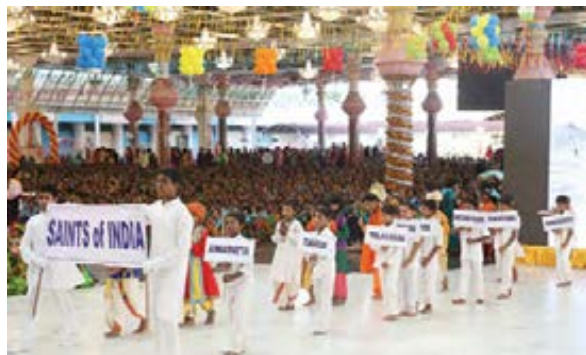
Grand Bal Vikas Rally in Sai Kulwant Hall.

The programme on 14th September 2019 began with a grand Bal Vikas Rally