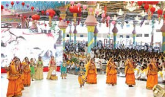
Dance drama by Bal Vikas children and Sai Youth of Visakhapatnam district.

On 24th August 2019, Bal Vikas children and Sai Youth of this district presented a dance drama entitled