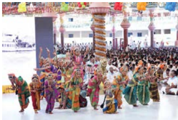
A dance number in the Bal Vikas Rally.

which showcased the culture of Bharat and particularly elucidated the rich cultural heritage of East Godavari district of Andhra Pradesh as also meticulously described Bhagavan Baba's visits to this district. Excellent dances of the children in glittering costumes which throughout