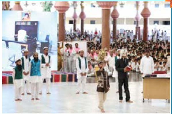
A real life scene depicted in the drama "The Dawn of Golden Age".