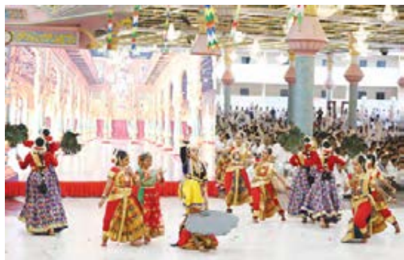
Dance drama "Krishnayanam" presented by Bal Vikas children of Thiruvananthapuram.

presented a dance drama "The Death of Arrogance" which beautifully depicted how Lord Siva subdued the ego and