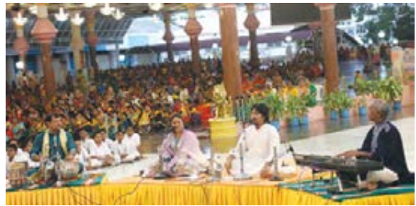
Hindustani classical devotional music programme.

On 22nd September 2019, the third day of the pilgrimage of the devotees from Uttar Pradesh and Uttarakhand, a