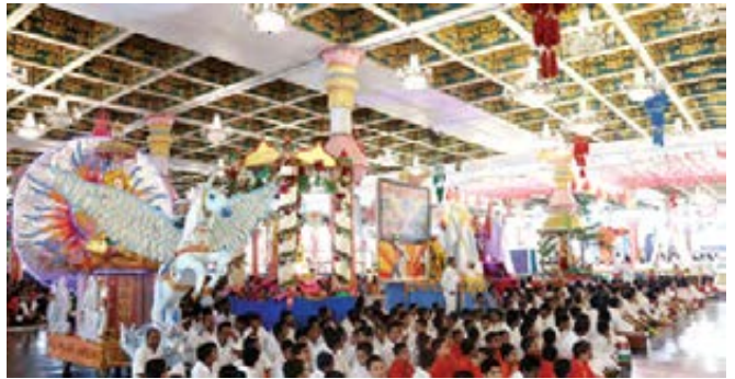
An enchanting sight of 21 Ganesh idols on vehicles of attractive shapes and designs in Sai Kulwant Hall.

The worship of the Ganesh idols was performed by the students of Bhagavan's educational institutions and the Ashram and hospital staff in their respective premises on 2nd and 3rd September 2019. These consecrated