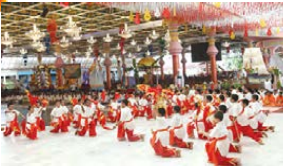
A beautiful dance dedicated to Lord Ganesh by the students of Sri Sathya Sai Primary School.

all the 21 Ganesh idols, after which the groups of students and Ashram staff brought them one by one in front of the Samadhi of Bhagavan to seek His blessings. After this, the idols were taken out of the hall for immersion. Meanwhile, Bhajans continued in Sai Kulwant Hall and came to a close with Arati.