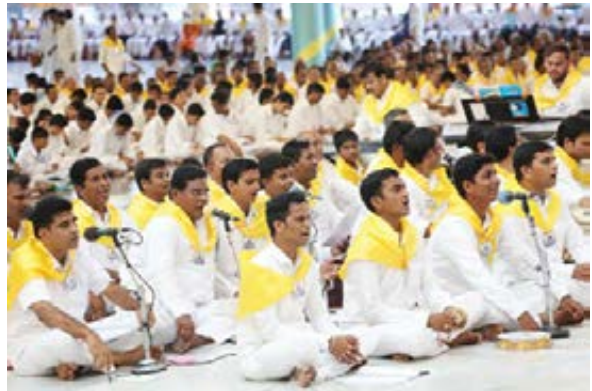
A devotional music presentation by the devotees of Visakhapatnam district.

On 25th August 2019, the devotees of Visakhapatnam district presented a devotional music programme, the music