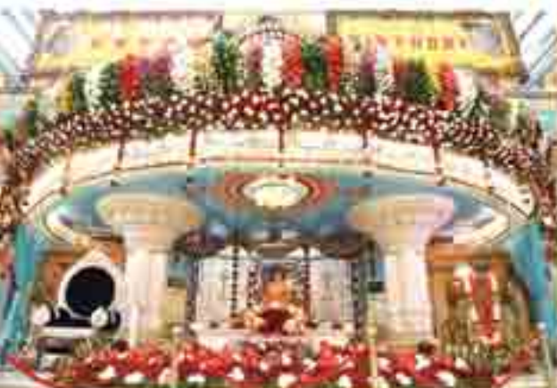
Sri Sathya Sai Sathyanarayana Vratam.