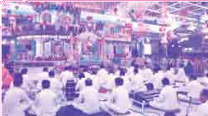
Jhoola Mahotsava in Sai Kulwant Hall.

glittering golden chariot with a beautiful photograph of Bhagavan started at 5.00 p.m. from Ganesh temple led by musicians and Veda chanting and Bhajan singing groups of students. A sizeable number of devotees joined this grand procession, observing all the norms of social distancing. After circumambulating the Prasanthi Mandir precincts, the golden chariot reached Sai Kulwant Hall at 5.40 p.m. where Arati was offered to Bhagavan.