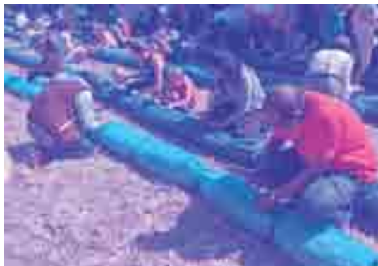
Protecting the ecosystem endangered by oil spill, Mauritius.

On 25th July 2020, a Japanese ship ran aground on the southern reefs of Mauritius, creating an unprecedented ecological disaster for the island. The ship spilled hydrocarbons and an estimated 1,000 tons of fuel into a protected marine park which had pristine coral reefs and mangrove forests that supported endangered species. A massive clean-up operation was