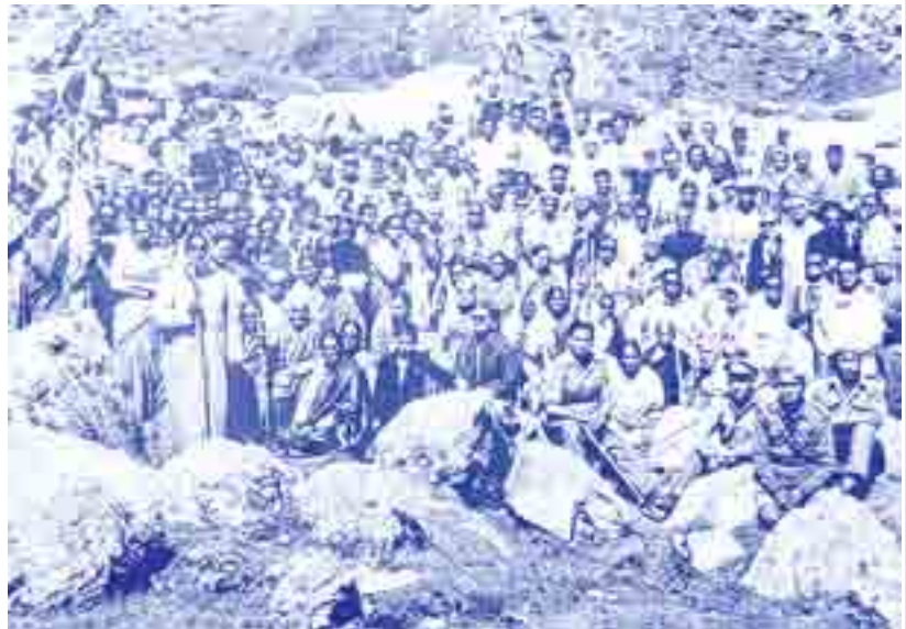
The entourage to Badri with Bhagavan.