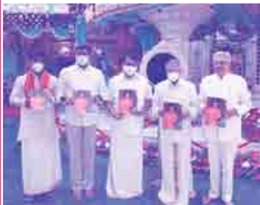
Annual Report of Sri Sathya Sai Central Trust released.

The programme in the evening started with golden chariot procession. The