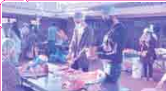
Sri Sathya Sai Food Kitchen, South Africa.

indigent people in and around the greater Durban area.