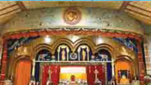
39th Convocation of SSSIHL.