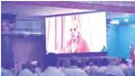
The Chief Guest of the Convocation delivering her Convocation Address virtually.

The Chief Guest Dr. Soumya Swaminathan then virtually delivered her Convocation Address. Underlining the urgent need for people to live in harmony with each other and with Nature, Dr. Swaminathan cautioned that unlimited consumerism and accumulation of wealth in a few hands could lead to disastrous results. Deploing the lack