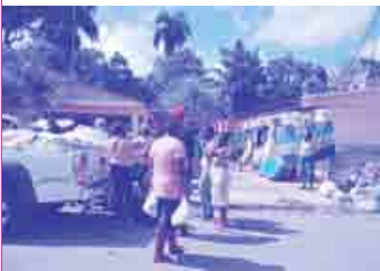
Humanitarian relief in Tropical Storm, Dominican Republic.

On 30th July 2020, Tropical Storm Isaiás made landfall in Dominican Republic, damaging more than 1,000 homes in Hato Mayor, a province in the eastern part of the country, and displacing thousands of people. SSSIO volunteers immediately responded by identifying the families most affected by the storm and delivered 55