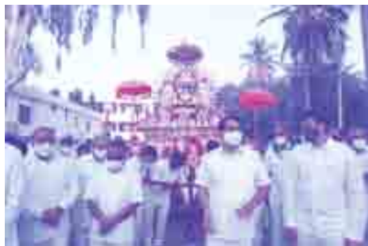
Golden chariot procession.