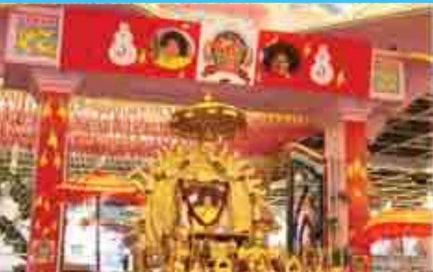
Sri Sathya Sai Golden chariot procession.