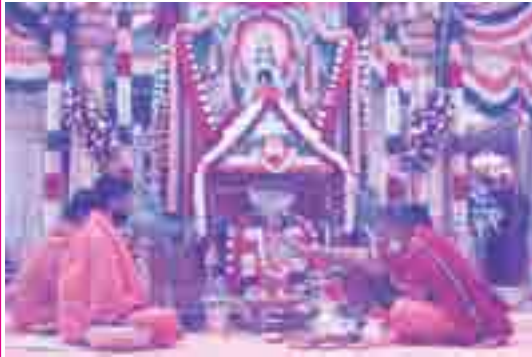
Sri Sathya Sai Sathyanarayana Vratam.

a specially decorated platform in front of Bhagavan's Samadhi at 8.15 a.m. Soon after this, the priests started the Puja of the idol of Sri Sathya Sai Sathyanarayana amidst sacred Vedic chants. Ceremonial worship of the idol of Sri Sathya Sai