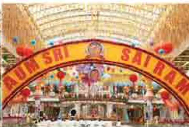
Rathotsavam at Prasanthi Nilayam.