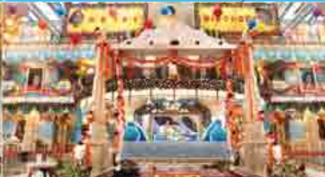
Jhoola Mahotsava in Sai Kulwant Hall.