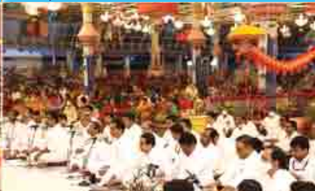
Musical offering by Prasanthi Mandir Bhajan Group.