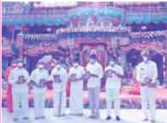
"Sri Sathya Sai Sathyanarayana Vrata Kalpam" book released.

Sathyanarayana was followed by recitation of Sri Sathya Sai Astottharashata Namavali (108 Names of Lord Sai). The life story of Sri Sathya Sai Sathyanarayana was then narrated in Sanskrit with an introduction in English in the beginning. The Puja concluded with offer of Arati to the idol. It was a blissful experience for the devotees to witness the Puja and listen to the life story of their Beloved Sri Sathya Sai Sathyanarayana. At the end of this