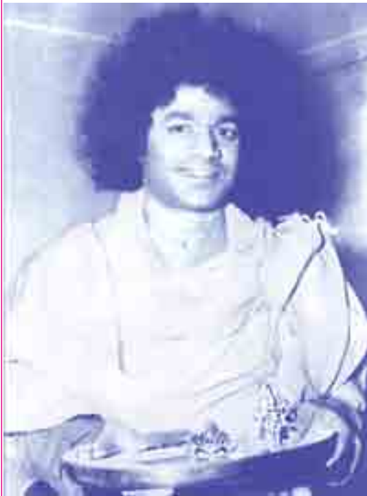
Bhagavan with the manifested Linga and Badri Narayana deity.

were Nambudiris (priests). Their ancestors had been there since Adi Sankara's time. They did not even allow Swami to go near and climb up. Badri Narayan deity was on a higher platform. We could not go near. Swami said, "Let us take this God with us..." and saying that in the inner sanctum, Swami took a silver plate from someone. All of a sudden, Swami began waving His hand and materialised a golden petalled lotus. Swami waved His hand again and