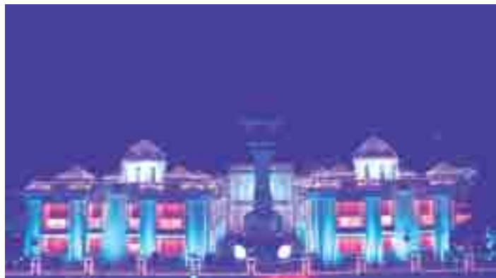
Grand illumination of Yajur Mandir.

Kulwant Hall, the venue of the Birthday programmes, was aesthetically decorated with attractive buntings, festoons and other decorations. Besides, there were brilliant illuminations at night on Sai Kulwant Hall and Yajur Mandir.