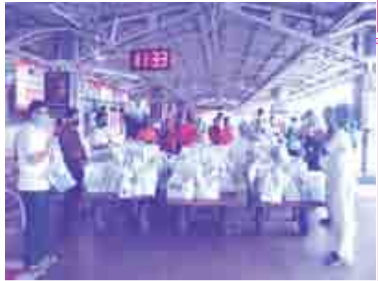
Amruta Kalasham family kits.

Odisha: All Samithis in Odisha have been adopting some destitute families and providing them Amruta Kalasham every month as directed by Bhagavan. During this period of unprecedented crisis which had thrown many families into unknown misery, SSSSO Odisha came forward to identify such families and support them with Amruta Kalasham kits. This programme was aimed at reaching the poor and needy families, who were unable to earn anything due to lockdown restrictions and could not afford two square meals for themselves. With the extension of the lockdown, their miseries only multiplied till Bhagavan