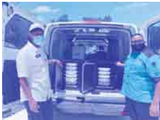
Meal distribution, Texas, USA.

by the Society of St. Vincent de Paul of the Archdiocese of San Antonio. It provides three hot, nutritional meals each day, 365 days a year, serving an average of 1,000 meals per day to the needy. Since the end of April 2020, volunteers from Sri Sathya Sai Centre of San Antonio have helped