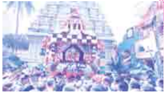
Rathotsavam at Prasanthi Nilayam.