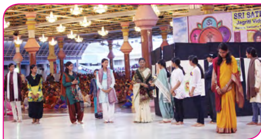
The drama “Love All, Serve All” showcased the teachings of Bhagavan.

The last item of the programme was a dance drama entitled “Love All, Serve All” presented by the students of Sri Sathya Sai Jagriti Mandir, Darwa, Yamuna Nagar (Haryana). The drama showcased the teachings of Bhagavan that a noble life dedicated to the service of mankind was superior to a life centred on worldly and professional achievements. This theme was depicted through the life story of two