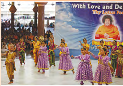
Matru Bhakti: A Drama.