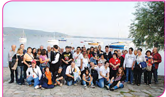
Sathya Sai volunteers with people with disabilities caused by an earthquake in Italy.

The region of Emilia, Italy was struck by an earthquake. Between 5th and 7th October 2012, the Sathya Sai Organisation of Italy played host to 36 people with disabilities who were affected