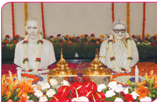
Offerings at the idols of Divine Parents, Mother Easwaramma and Sri Pedda Venkama Raju.