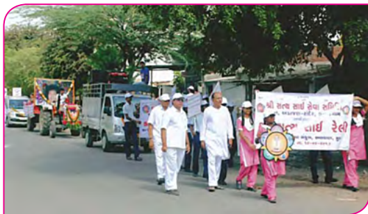
Rallies were held all over Gujarat to celebrate Sri Rama Navami.

Rallies were organised all over Gujarat to celebrate Sri Rama Navami on 19th April 2013. Devotees, youth, Bal Vikas