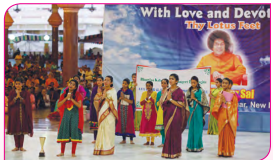
A scene from the drama "Matru Bhakti" presented by the students of Sri Sathya Sai Vidya Vihar, New Delhi.

The last item of the programme was a touching drama "Matru Bhakti" (devotion to mother) which was enacted by the students of Sri Sathya Sai Vidya Vihar, New Delhi. Presented on the eve of Easwaramma Day, the drama depicted the sacredness of mother's love through the story of a girl who considered her mother as the best mother of the world and wanted