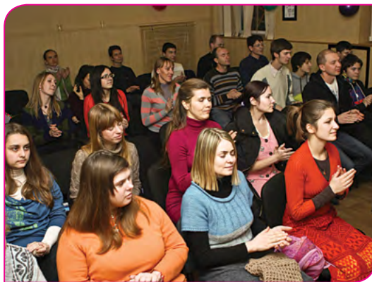
Participants in Sathya Sai Youth Conference held in Kyiv, Ukraine.

The Ukrainian Sathya Sai Youth Conference of 2012 was held on 15th and 16th December 2012 in Kyiv and was