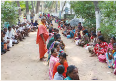
Narayana Seva: Easwaramma Day.

REGD. WITH REGISTRAR OF NEWSPAPERS R.NO.10774/1958 REGN.NO. HDP/002/2012-2014 Licenced to post without prepayment No. HDP/002/2012-2014