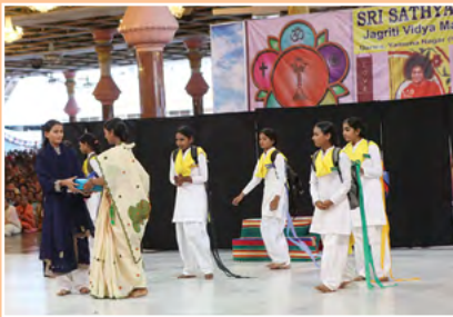
Love All Serve All: A Dance Drama.