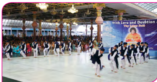
Garhwali dance by the students of Sri Sathya Sai Vidya Vihar, Rishikesh.

The programme on 5th May 2013 commenced at 5.20 p.m. after regular Veda chanting in Sai Kulwant Hall which was befittingly bedecked for this important event. The first item of the programme