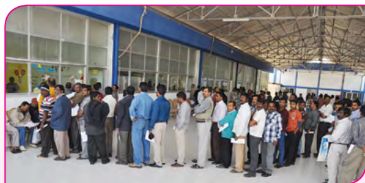
Patients in the medical camp in Kuwait.