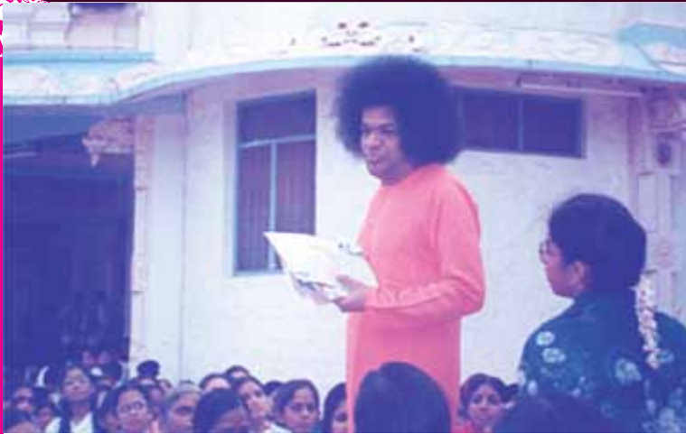
Bhagavan with the students of Anantapur Campus.

to Puttapparthi from Anantapur for Swami's Darshan and those days, we were allowed to take trays of toffees for 'birthday blessings' from Bhagavan. I was sitting behind a girl holding such a tray. Swami came near us, picked a whole fistful of chocolates and showered them merrily all over us and walked away. After He had gone quite a distance, I found a sister next to me suddenly weeping uncontrollably. I knew she was not too well; she had some eye ailment, that needed a minor surgery. And then she told me what had just occurred.