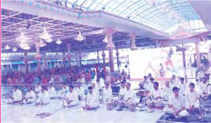
"Ramayana through Sai Bhajans", a musical presentation.

"Raghunandana Hey Raghunandana", "Sri Rama Charanam Sri Rama Charanam Sri Rama Charanam Bhaje", "Om Sri Ram Jai Ram Jai Jai Ram", "Karuna Samudra Sri Rama". The programme concluded with the video screening of the Bhajan "Rama Rama Rama Sita" sung by Bhagavan.