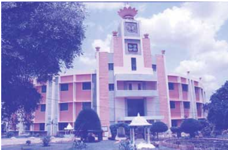
Anantapur College for Women, Sri Sathya Sai Institute of Higher Learning.

In fact, the way of the Spirit is the base on which the way of the world truly rests. God is not to be worshipped on certain days, or at