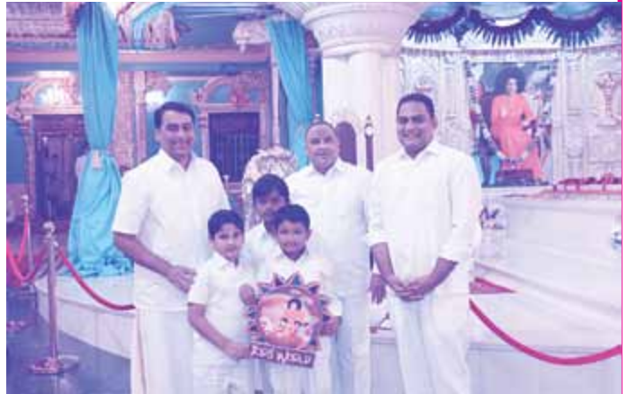
Launch of the new YouTube channel "Sri Sathya Sai Kids World".

presentation "Ramayana through Sai Bhajans" in Sai Kulwant Hall on 31st January 2021. The programme which started at 5.00 p.m. showcased the divine and sacred life story of Lord Rama through Sai Bhajans accompanied by an enrapturing commentary and beautiful illustrations on the LED screen. This most elevating and lively programme, based on the book "Ramakatha Rasavahini" written by Bhagavan Sri Sathya Sai Baba included popular Sai Bhajans which included