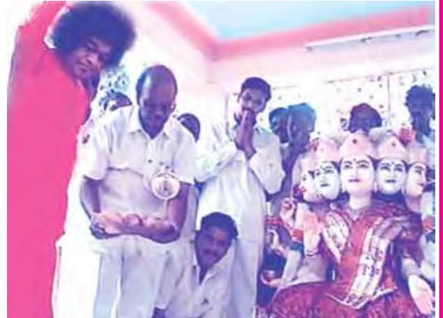
Bhagavan consecrating the Gayatri Temple.

The date for the consecration was fixed – 9th October 1998. Before the consecration and installation, for three days, a Yajna with elaborate rituals was held in one of the halls