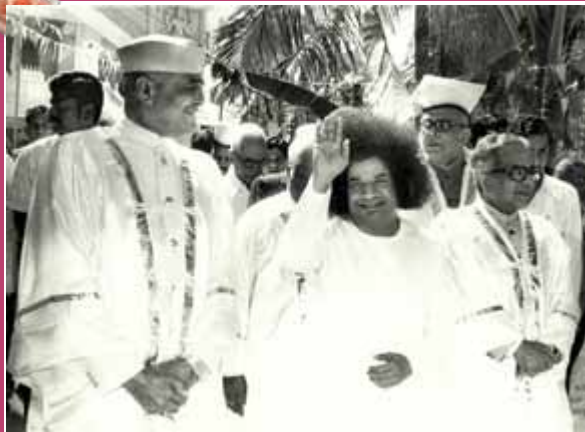
Inauguration of SSSIHL on 22nd November 1981 at Prasanthi Nilayam by Justice Chandrachud (on the right).

manifestation of the Divine Sankalpa was witnessed thirty years later, when Justice Y.V. Chandrachud, Chief Justice of India, inaugurated Sri Sathya Sai Institute of Higher Learning on 22nd November 1981 at Prasanthi Nilayam.