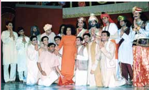
Swami with students after the Convocation Drama in 2003.

While the what, when, where and how of life are the focus at institutions of higher learning, the why of life – the purpose of life is often neglected. The valuable hours spent in the Mandir in the Divine Presence expose Sai Students to newer vistas that enable them to understand the mystery behind their sojourn on this planet