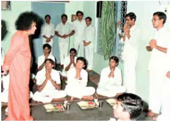
Swami in the hostel dining hall in 1988.

visits, students would decorate their self-reliance departments and invite Swami to bless them. He would also make surprise visits to the hostel to inspect whether the rooms were maintained as per standards expected by Him. On such occasions, Swami would also visit the kitchen and review various items cooked for students and even observe cleanliness of vessels