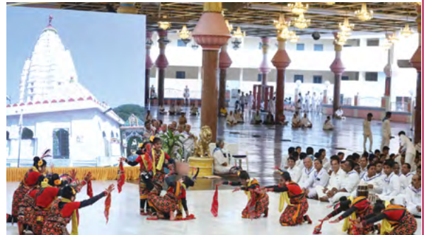
A folk dance by the students of Sathya Sai Vidya Mandir, Bhawanipatna.

The programme on 27th August 2018 began with Sambalpuri folk dance, a popular folk dance form of Odisha, by the students of Sathya Sai Vidya Mandir, Bhawanipatna.