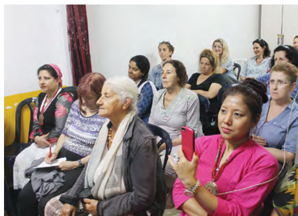
Education in Human Values Seminar, Israel.

More than 50 people attended the 8th SSEHV seminar presented by the ISSE of South Europe on 2nd June 2018 at the Sathya Sai Centre of Tel Aviv. The programme began with a presentation on