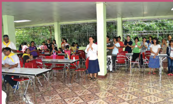
Service in Good Shepherd Sisters' Home, Thailand.

The evening began with devotional singing, followed by a Thai dance programme by the inmates. A delicious dinner was served to the inmates, nuns, staff and the volunteers.