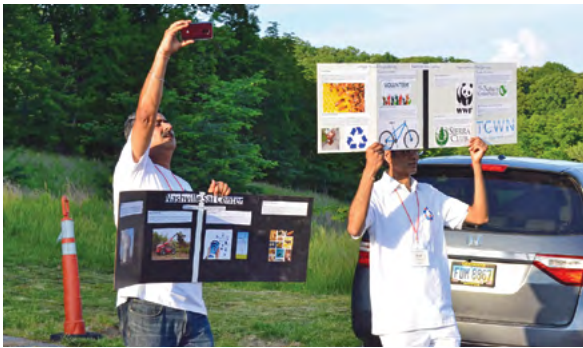
Animal Shelter Supplies Drive, U.S.A.

T HE ST. LOUIS COUNTY PET Adoption Centre in Olivette, Missouri requested the SSIO to help with meeting the ever-growing need for supplies to take care of more than 75 animals in their shelter. SSIO members in the mid-central region of U.S.A., from the States of Illinois, Kansas, Kentucky, Missouri, Mississippi and Tennessee, organised an 'Animal Shelter Supplies Drive' to express their love and support for the animals at the SSIO Annual Conference at Camp Wyman, Eureka, Missouri between 25th-27th May 2018. The SSE children made toys and posters for cats and dogs with pure love and excitement. Volunteers brought in pet food,