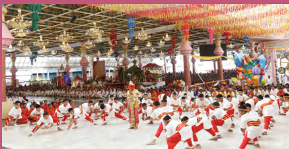
The students of Sri Sathya Sai Primary School put up a delectable dance performance in Sai Kulwant Hall.

held on 15th September 2018. It was a grand spectacle for the devotees to witness decorated Ganesh idols mounted on artistically designed 21 chariots and