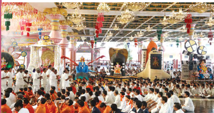
A grand spectacle of Ganesh idols in Sai Kulwant Hall.

held on 15th September 2018. It was a grand spectacle for the devotees to witness decorated Ganesh idols mounted on artistically designed 21 chariots and