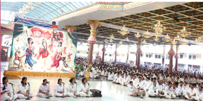
Devotional music presentation by the Bal Vikas children of Odisha.

Dedicated to Mother Sambaleshwari, the presiding deity of Sambalpur, the dance portrayed the ceremonial coming out of Mother Sambaleshwari from the temple with rhythmic steps accompanied by the beat of drums and other musical instruments.