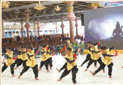
Siva Tandava cosmic dance by the students of Sathya Sai Vidya Mandir, Bhawanipatna, Odisha.