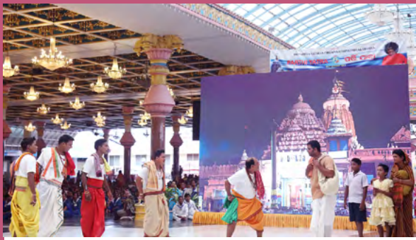
The drama "Bandhu Mohanty" highlighted the power of devotion.

story of Bandhu Mohanty, the drama performed by the youth of Odisha presented a classic example of Lord Jagannath's love for his true devotee who had firm faith that the Lord was his Bandhu (friend). Talented and natural acting of the protagonist, superb direction and noble theme made the drama a sterling presentation. Bhajans led by Sai Symphony Team of Odisha youth followed next and concluded with Arati.