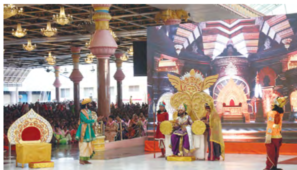
A scene from the drama "The End of Education is Character".

September 2018. Illustrated beautifully by some episodes from the Mahabharata, the drama depicted how the Pandavas followed the teachings of Lord Krishna and developed the virtues of Sathya and Dharma while the Kauravas took instructions from Sakuni and developed bad qualities of jealousy, hatred and deception which led to their destruction.