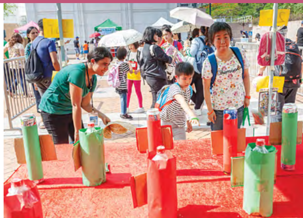
Go-Green Fun Fair, Hong Kong.

On 12th May 2018, the SSIO of Hong Kong organised a Go-Green Fun Fair titled, 'Let's Green It Up' at the Kowloon Park, an open air public park in the heart of the city. About 150 underprivileged children and parents, including ethnic minority communities, took part in the joyful event. SSIO volunteers, including young adults and SSE children and teachers, set up seven game stalls which provided