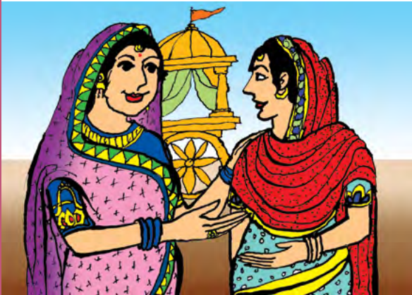
Rukmini invited Radha to her palace.

That evening, even while approaching Rukmini's chamber, Krishna told her, "Rukmini! Today I am feeling very much tired. My legs are paining". At once Rukmini started pressing His feet in an effort to assuage Krishna's pain. To her surprise, she found boils on Krishna's feet. With