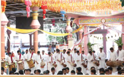
Auspicious notes by the Panchavadyam troupe of students.

LICENCED TO POST WITHOUT PREPAYMENT No.PMGK/RNP/WPP-01/2018-2020