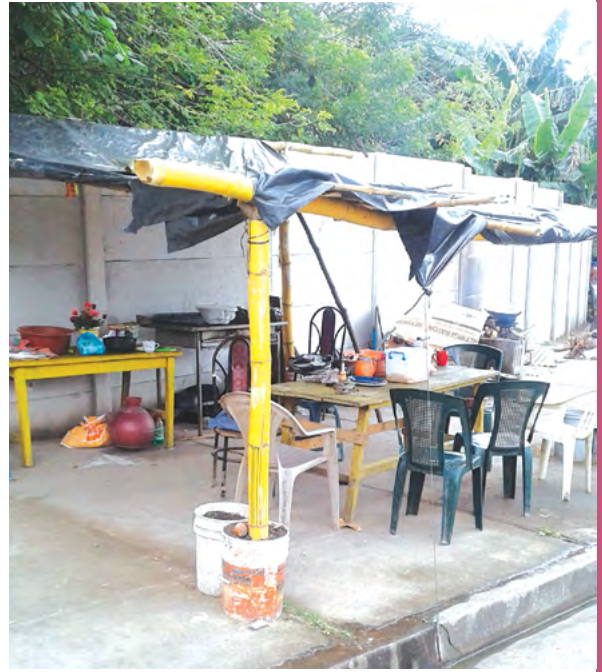
Shelters for the homeless, El Salvador.

A recent court decision in San Salvador resulted in 75 families being evacuated from a farm where most of them had lived all their lives. With the onset of the rainy season, the