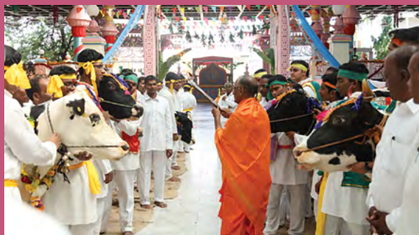
Arati offered to cows by the Mandir priest in Sai Kulwant Hall.

the Mandir priest. Meanwhile, Bhajans in the hall continued and concluded with Arati at 10.00 a.m.