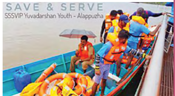
Relief materials were transported to needy people in far-flung areas by the Seva Dal volunteers of Sri Sathya Sai Seva Organisation.

Sri Sathya Sai Seva Organisation, Kerala rose to the occasion and rendered Seva to