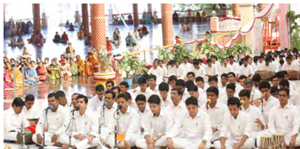
Devotional music presentation by students on Ganesh Chaturthi.

by Bhagavan's students which began with auspicious notes by the Panchavadyam troupe of students. This was followed by soulful rendition of Stotras (verses) and devotional songs dedicated to Lord Ganesh. The Stotras "Ganashtakam" and "Ganapati Stotram", a Carnatic song "Bhaja Manasa