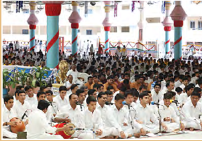
Students presented a music programme on the occasion of Sri Krishna Janmashtami.