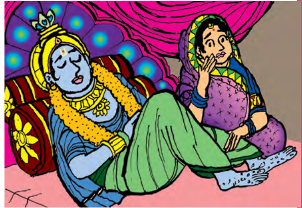
Krishna's feet got boils as Radha drank hot milk offered by Rukmini.

Honouring Rukmini's invitation, Radha went to her palace. Rukmini came to the entrance gate and ushered Radha into the palace with deep love and affection. After talking to Radha for a while, Rukmini brought