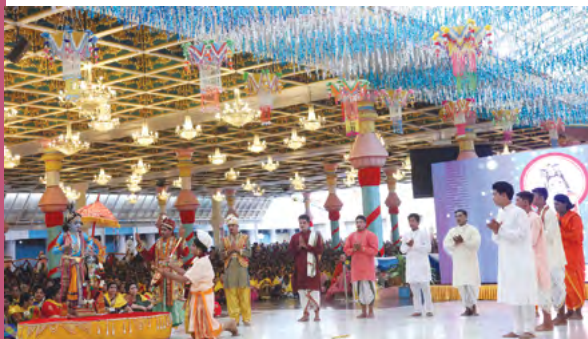
Drama on the life of Surdas.

More than 2,000 devotees came from Visakhapatnam district of Andhra Pradesh on a three-day pilgrimage to Prasanthi Nilayam from 1st to 3rd September 2018. On the eve of the holy festival of Sri Krishna Janmashtami, Sai Youth of this district performed a beautiful musical dance drama "Swara Sagaram" on 2nd September 2018