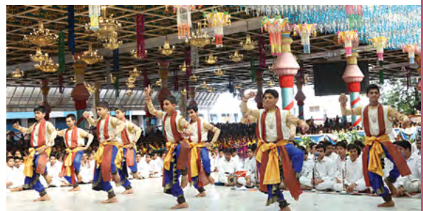
Students enacting the Leelas of Lord Krishna through a beautiful dance.

The holy festival of Sri Krishna Janmashtami was celebrated at Prasanthi Nilayam on 3rd September 2018. The programme in the morning began at 8.00 a.m. with Veda chanting followed by a soulful musical offering by the students of Bhagavan's educational institutions. The students described the Divine glory of Lord Krishna by singing Stotras and devotional songs and enacting the Leelas of Krishna