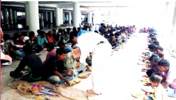
Narayana Seva in Shimla, Himachal Pradesh.

Himachal Pradesh: Heavy rainfall this rainy season slowed down the pace of life across the State. It also caused landslides and loss to crops. Labourers and slum dwellers who could not manage their daily earning were helped by Sri Sathya Sai Seva Organisation in whatever way it was possible. In Shimla, 300 labourers, working for the construction of a multi-level parking on the outskirts of Shimla town, were given new umbrellas by Sri Sathya Sai Seva Organisation, Shimla district. Kits containing items of daily use were added. A mega Narayana Seva was